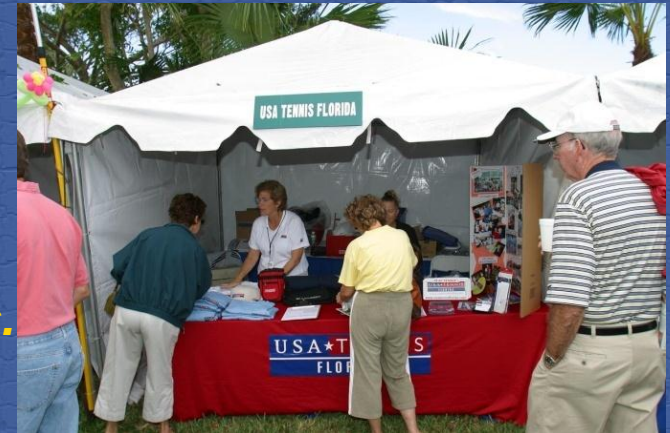
Florida USTA Section promotes its organization and services during Mardy's Tennis & Jake's Music Fest.