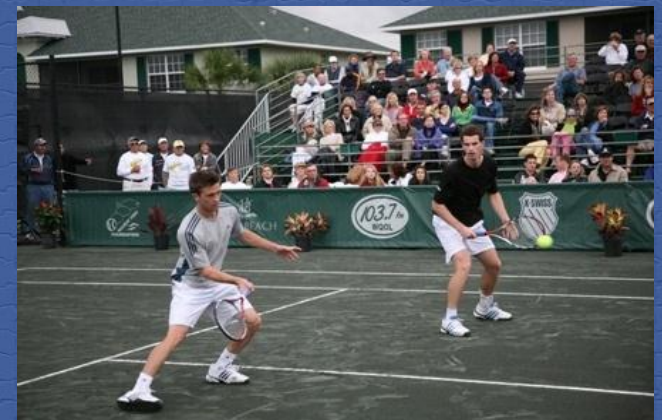
Official Sponsor signage displayed on the Exhibition Court.