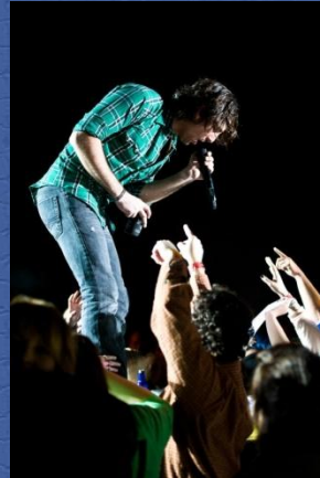
Jake Owen wows the crowd.