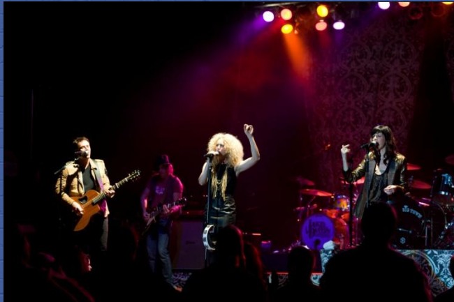
Special Guest Platinum-selling Capitol Nashville recording artists Little Big Town.