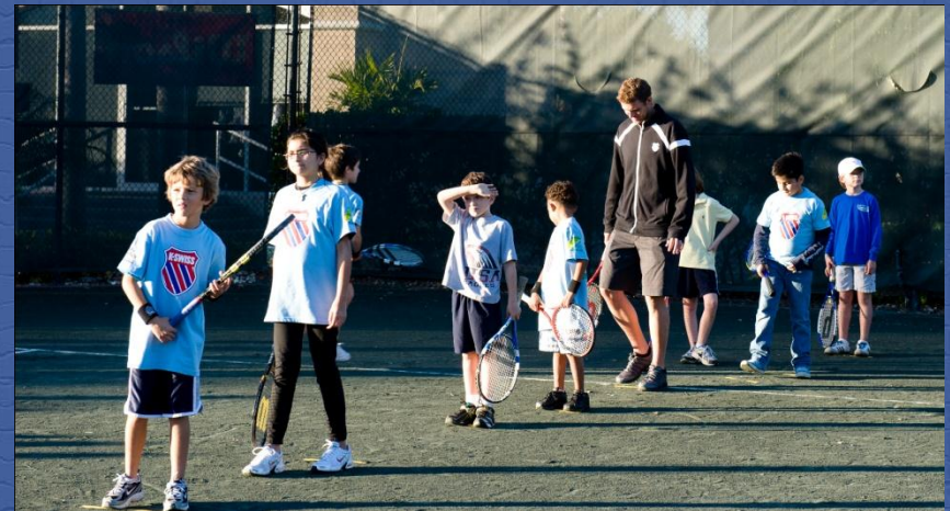
Youth that participated in the Kid's Tennis Clinic line-up for tennis drills with Mardy Fish.