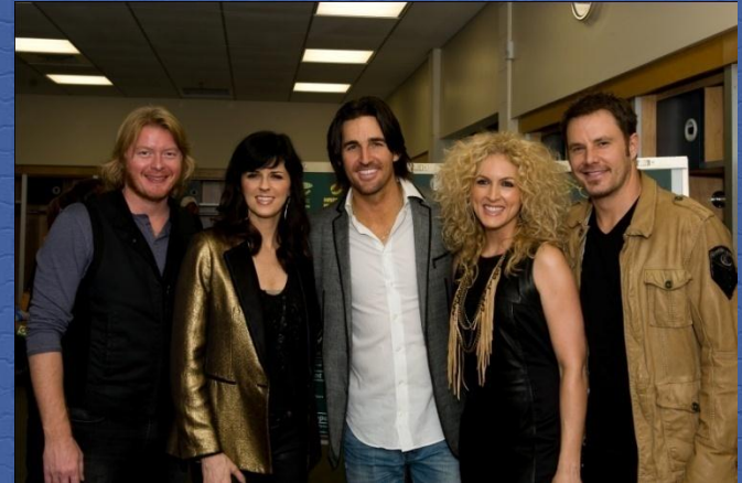
Jake Owen (center) and the members of Little Big Town at the Concert VIP Reception.