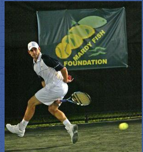
Andy Roddick supports the Mardy Fish Foundation.