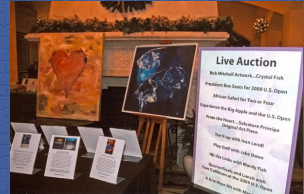
The Live Auction Items on Display.